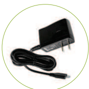
Micro USB Power Adapter (5V/1A)