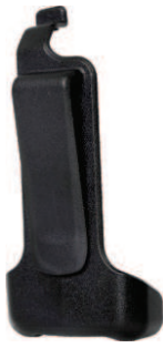
PD36X Belt Clip