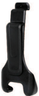
PD35X Belt Clip